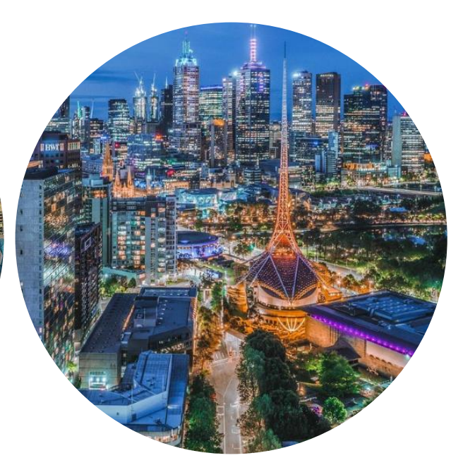
Arts Precinct Leadership

Revitalisation, management and ongoing operations of Federation Square